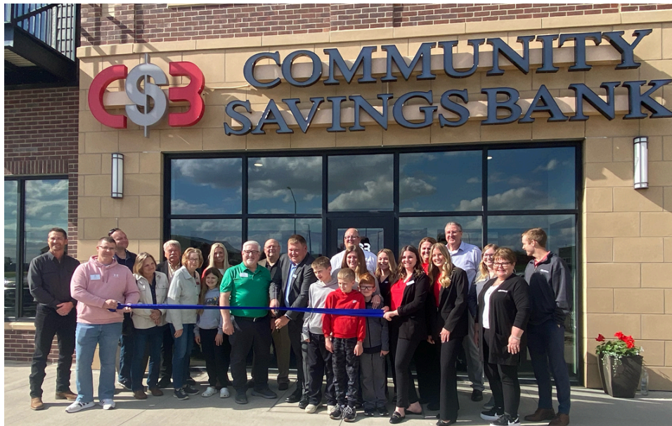
A ribbon cutting and open house took place on Wednesday, April 29th